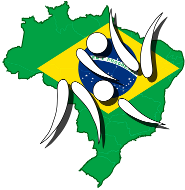
Image: Brazilian Judo Logo