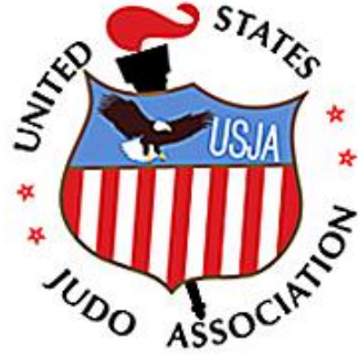
U.S. Judo Association logo (usja.net)

Research a Judo organization or a Judo dojo teacher in the United States.